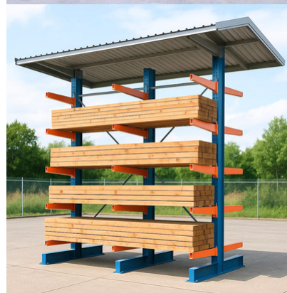
Sheltered cantilever for outside application