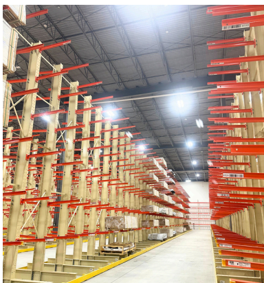
Double sided cantilever