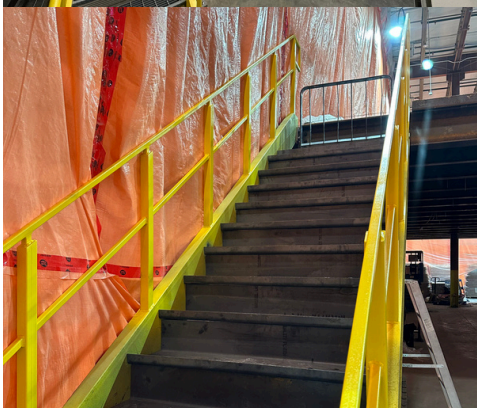
Stairs and handrails