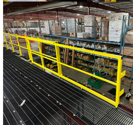
Access Gate Systems