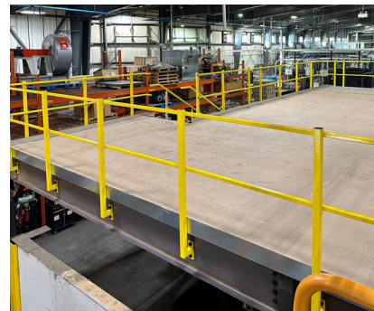
Guard Railing Supports