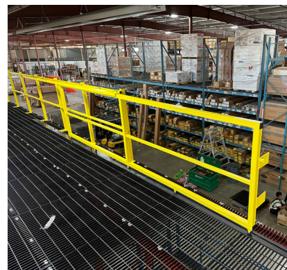
Access Gate Systems